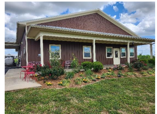
The Wesselhoeft Family Store front of The Ocheessee Creamery

We both bought some of his ice cream and other products to taste test them. BOY! was that some good ice Cream. I picked up two containers and ate them within a week. Time for some more!