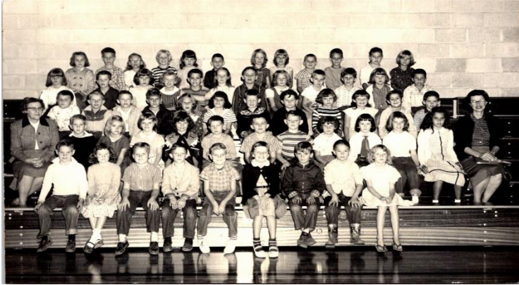
Wewahitchka Elementary School