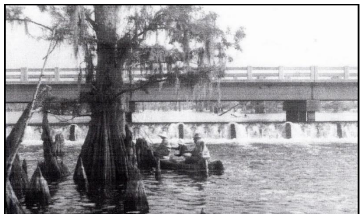
AN OLD PHOTO SHOWING THE OLD DAM STILL IN PLACE It was installed in 1967 and removed 20 years later.