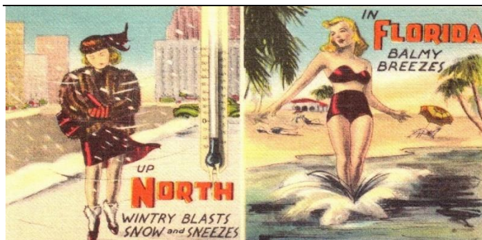
ANOTHER OLD POST CARD FROM FLORIDA'S PASS